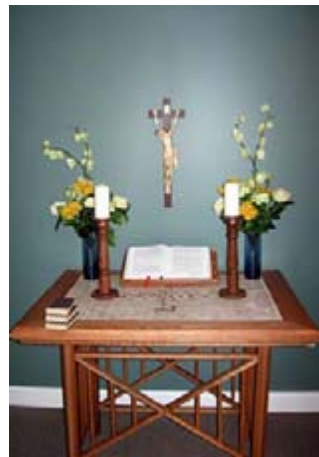
The chapel at House of All Souls