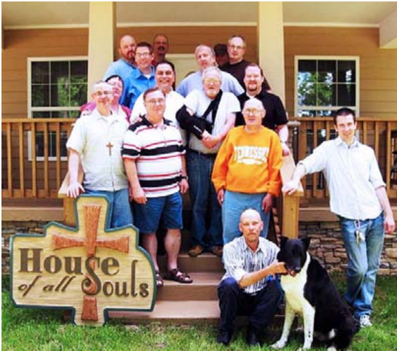
Retreat at the House of All Souls